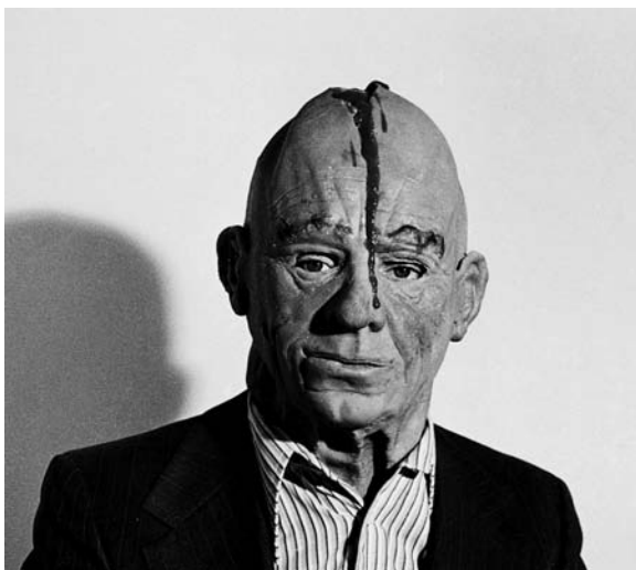
Figure 7. Paul McCarthy, Hollywood Halloween , 1977, performance

disabled. The video of Class Fool (1976), for example, shows the audience's reaction to his performance, moving from amusement, to hesitation, to aversion. At some level, McCarthy's commitment to elemental behavior—smearing himself with food, repeating meaningless actions until they are ritualized, fondling himself in public—asks to be seen as idiocy, as if the core values of intelligence and genius were being systematically removed from the aesthetic in preference to stupidity and cognitive disorder. Plaster