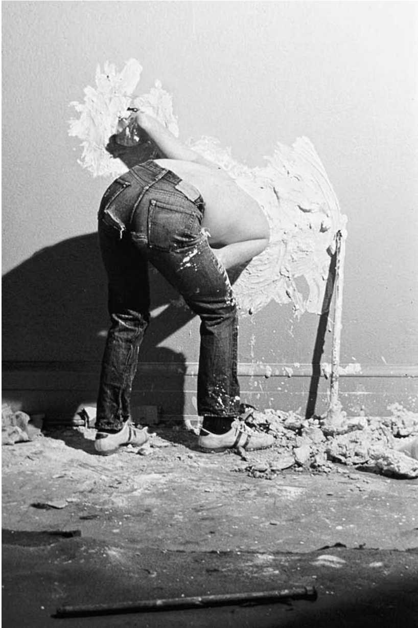
Figure 8. Paul McCarthy, Plaster Your Head and One Arm into a Wall , 1973, performance