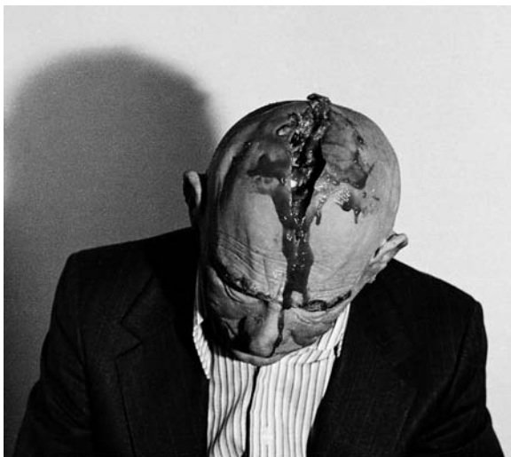
Figure 6. Paul McCarthy, Hollywood Halloween , 1977, performance