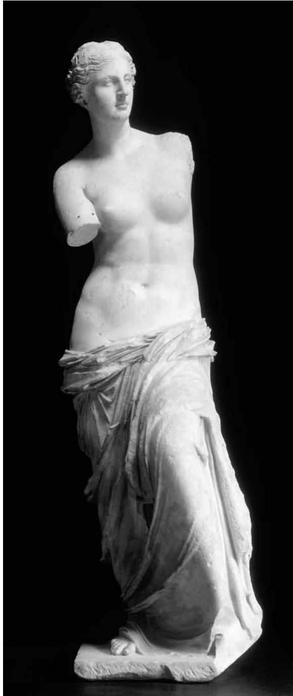
Figure 1. Venus de Milo, 100 BCE, Paris, Louvre